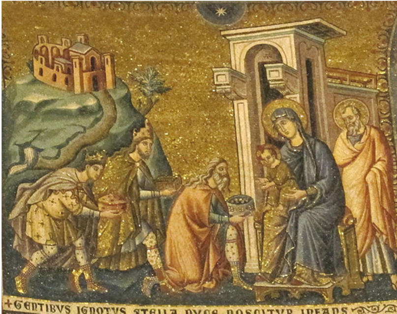
Pietro Cavallini, Adoration of the Magi , mosaic, XIII-th century, Santa Maria Basilica in Transevere, Rome.

Having as model the conceptional schemes from Catacombs and Sarcophagi, the Adoration theme is treated with a lot of interest by many artists from post-Byzantine area until the early Baroque.