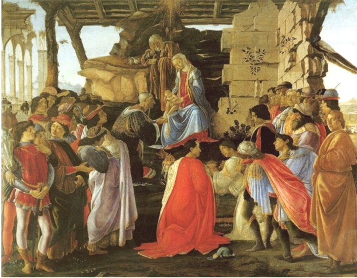
Sandro Botticelli, Adoration of the Magi , tempera on wood, 1475, Galleria degli Uffizi, Florența.

The beauty of this painting followed by a large variety of preparatory studies consists in the strict and balanced organization of the whole picture dominated by multiple characters. It was unfinished. The Virgin with the Holy Child can be seen at the bottom of the picture, surrounded by many people full of devotion and adoration. Between Her and the two old men symmetrically placed on both sides of the scene, forming a triangle. It is taken over by the semicircular shape of the grouped figures. Behind them are ruined buildings, horses, riders, a magnificent scale, trees and other figures captured in various movements. 14 We can distinguish a fight between two stallions on the right side. The theme is conceived in light and shade contrast and defines the art of Leonard. It was considered a novelty in that period, a period that marked the end of his collaboration with Verrocchio.