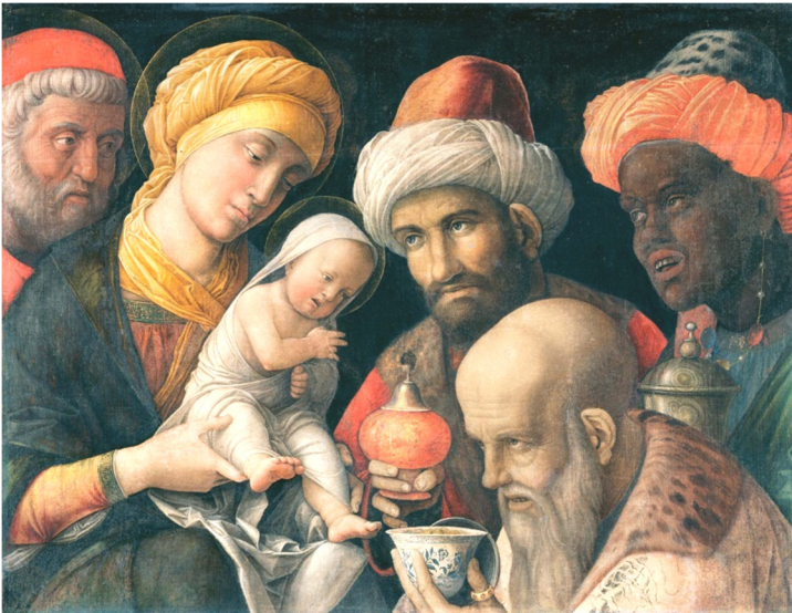
Andrea Mantegna, Adoration of the Magi , tempera on wood, 1497-1500, Getty Museum, Los Angeles.

Designed in a festive atmosphere inaugurated by Botticelli and influenced by the unfinished painting of Leonardo, Fra Filippino Lippi's Adoration of Magi was ordered by the monks from San Donato agli Scopet Monastery, Florence. In essence, the scene is being recomposed in a pyramidal shape, to which the Renaissance artists are so fond of, although the lack of unity and organization characterizes the painting. As in Botticelli's masterpiece, in this case are also present the members of the Medici family; the painting brings out figures that are in relation with the landscape from the second plan. 15