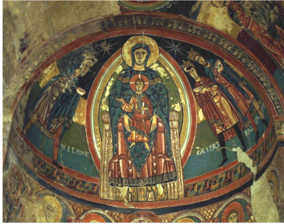
Adoration of the Magi, fresco, XII-th century, Taull Church.

The artist chose to illustrate this theme, not together with other scenes from the church iconography, but in the Holy Altar Apse. If in almost every example, The Virgin with The Child are on one side or the other, in this case, they dominate the central semi-calotte. What is more, they are framed by a large mandorla. On the background of a colored strip and willing asymmetric, are the Magi, one on the left side and the other two on the right side. In terms of composition, the artist assumes the traditional structure of the Madonna and Child on a Curved Throne, met in Byzantine and Post-Byzantine iconography.