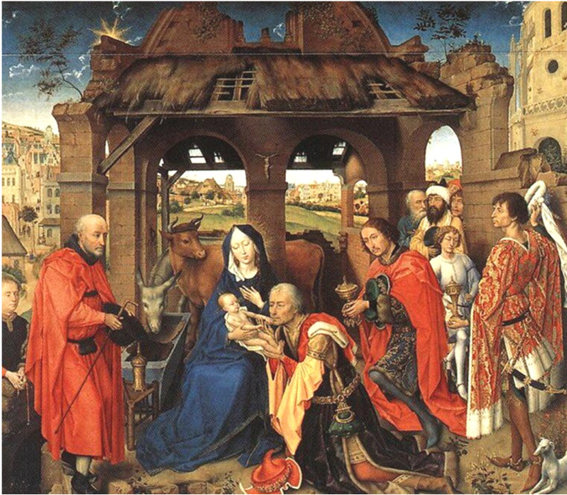
Van der Weyden, Triptych Adoration of the Magi , oil on wood, 1455-1460, Alte Pinakothek, München.

The emphasis is on the Magi clothing. They can be seen in the main plane of the working. 11