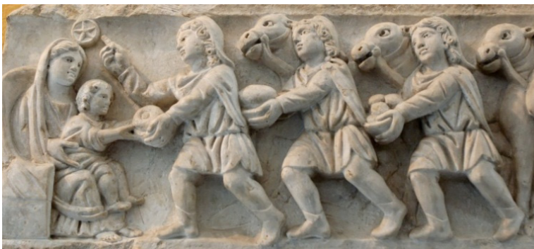
Adoration of the Magi, bas-relief, IV-th century, Pio Cristiano Museum, Rome.

The composition plastically narrates the gifts presentation of the Magi to the Son of God and to His Mother. The Child is in swaddling-clothes, held by Mary. Magi are accompanied by the busts in relief of some camels. In the back of the throne, we can distinguish the empty manger, according to Saint Luke the Evangelist (2, 12), followed by the two symbolic animals: the ox and the ass. Flanking the right side of the bas-relief, Saint Joseph has a high staff, being emphasized having raised the left hand.