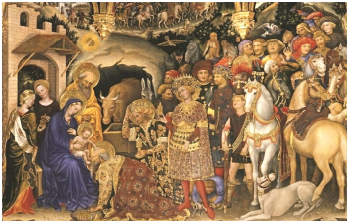
Gentile da Fabriano, Adoration of the Magi , tempera on wood, 1423, Galleria degli Uffizi, Florence.

The broad perspective of Gentile da Fabriano proposes a magnificent scene that illustrates the spectacular art of picture. The author exceeds the restricted frame of byzantine patterns, turning it into a large one, grandiose due to the impressive number of figures, animals and architectural elements.