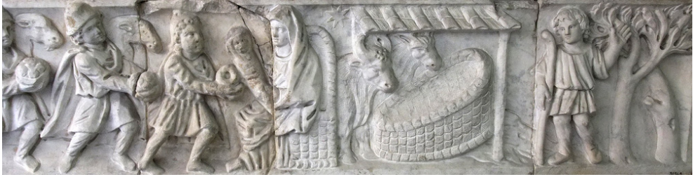
Adoration of the Magi, bas-relief, IV-th century, Vatican Museum, Rome.

In both examples, we can observe the representation of Mary and Jesus, usually in profile, and in front of them are the three Magi; with a bigger liveliness in movement, rhythm and the details stated above is the mural/fresco from the fourth century from the Catacombs of San Callisto. Among the remarkable presentations of this theme, we can remind the mosaics of the Basilica of San Vitale 6 from Ravenna, or the ones from Santa Maria Maggiore from Rome.