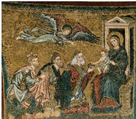
Jacopo Torriti, Adoration of the Magi, mosaic, XIII-th century, Santa Maria Maggiore Basilica, Rome.

The artist chose to illustrate this theme, not together with other scenes from the church iconography, but in the Holy Altar Apse. If in almost every example, The Virgin with The Child are on one side or the other, in this case, they dominate the central semi-calotte. What is more, they are framed by a large mandorla. On the background of a colored strip and willing asymmetric, are the Magi, one on the left side and the other two on the right side. In terms of composition, the artist assumes the traditional structure of the Madonna and Child on a Curved Throne, met in Byzantine and Post-Byzantine iconography.