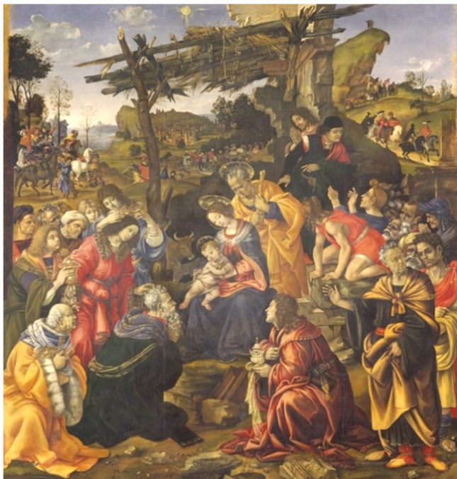
Filipino Lippi, Adoration of the Magi , oil on wood, 1496, Galleria degli Uffizi, Florence.