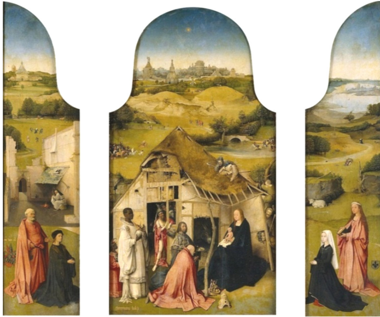
Bosch Jeronimus, Adoration of the Magi , tempera and oil on wood, 1460, Metropolitan Museum of Art, New York.

With an obvious emphasis for the understanding of the binomial figure-universe or human-nature, Jeronimus Bosch chooses to present the Saint Matthew's text from a different perspective, placing the main theme on three parts, in a wide, opened landscape, dominated by the constructions that are shaped in the horizon. The humanization and individualization of the characters, with direct reference to the three ages of the man, but also to the three continents Europe, Africa, and Asia are important in the process of understanding the universal worshiping and adoration of Jesus Christ. 12