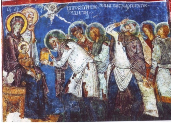
Adoration of the Magi, fresco, XII-th century, Cappadocia.

Something special, the fresco from Cappadocia presents a greater number of worshipers bringing gifts to Jesus. The Magi have around their heads, devoted positioned, white halos, while Mother of God, Jesus and Joseph have yellow halos. Another distinctive element is the appearance of the herald angel in the left side of the image, above all.