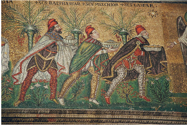
Adoration of the Magi , mosaic, VI-th century, Basilica San Vitale, Ravenna.

The complex composition from the Papal Basilica of Santa Maria Maggiore, reveals us a scene in which Jesus, on the throne, blesses the Magi, His Mother is near Him, as well as the Angels, a shepherd and a queen; the whole scene stands under the guiding star. The Magi are presented as being young, with colored clothing, wearing the Phrygian cap. There are some buildings with slender roofs that shape in the distance, Jerusalem.