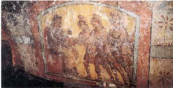
Adoration of the Magi , fresco, IV-th century, Catacomb of San Callisto, Rome.

The relief with the theme The Adoration of the Magi, resumes the conceptional scheme from the Catacombs of San Callisto 7 , in this case being more highlighted the entire ensemble. The Magi are presented as three young men with large movements, carrying offerings; the origin of the vestment is Phrygian. The three camels mark the origin and the place of the event. The first Magus shows with his right hand the guiding star, which is above Mary and the Holy Child sitting on throne. Also represented in profile, the couple Maria-Jesus expresses the inner peace, an intimate plastic aspect. The author does not invest the two figures with the sacred insignia, the halos.