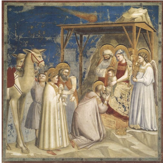
Giotto di Bondone, Adoration of the Magi , fresco, 1303-1305, Cappella degli Scrovegni, Padova.