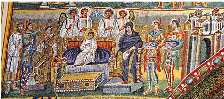
Adoration of the magi , mosaic, V-th century, Santa Maria Maggiore Basilica, Rome.

The scene from the Catacomb of San Callisto resumes, in a reduced form, The Adoration of the Magi. The clothing is important (the Phrygian caps), which are like a leit motif in all these anonymous compositions. The yellow background definitely makes us think at the future gold fund, which will be naturalized in the Byzantine canon.