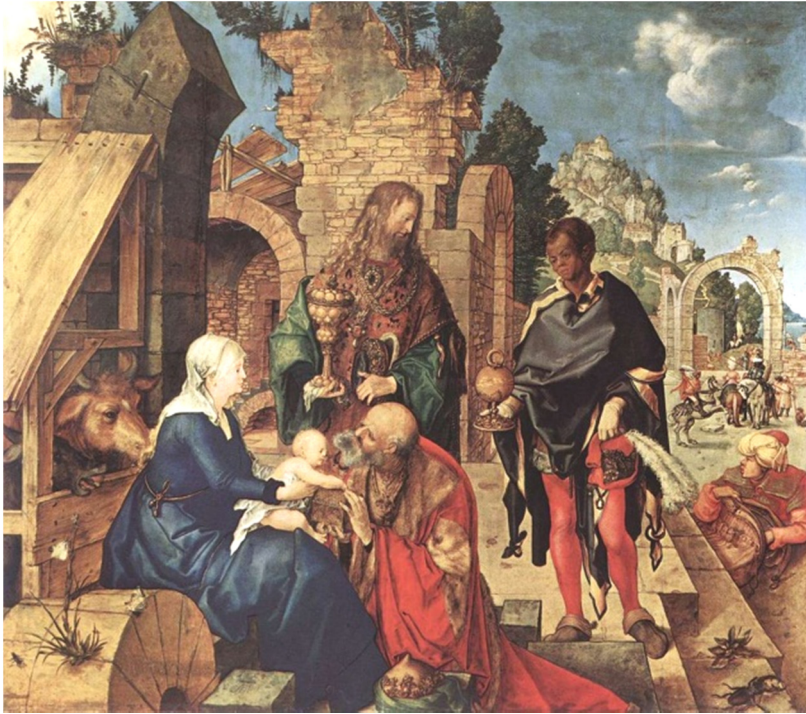
Albrecht Dürer, Adoration of the Magi , tempera on wood, 1504, Galleria degli Uffizi, Florence.

Dürer treats the evangelic theme with an assumed freedom, taking everything down, in a pyramidal shape and being influenced by the Italian Renaissance tradition; this is a form to which the architectural elements accede; the stable's roof, the fragmentary ruined wall, the mountain on the horizon. There are the perspective lines, which remind us of the albertinean studies and forge axes that go beyond the picture. What is important to be mentioned is the thoroughness with which the artist treats the Magi's object and accessories.