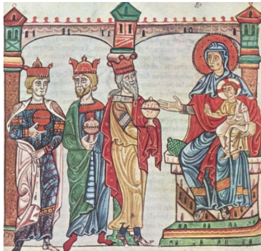
Adoration of the Magi, water colors on paper, XIII-th century, The Vatican Apostolic Library, Vatican.

Something special, the fresco from Cappadocia presents a greater number of worshipers bringing gifts to Jesus. The Magi have around their heads, devoted positioned, white halos, while Mother of God, Jesus and Joseph have yellow halos. Another distinctive element is the appearance of the herald angel in the left side of the image, above all.