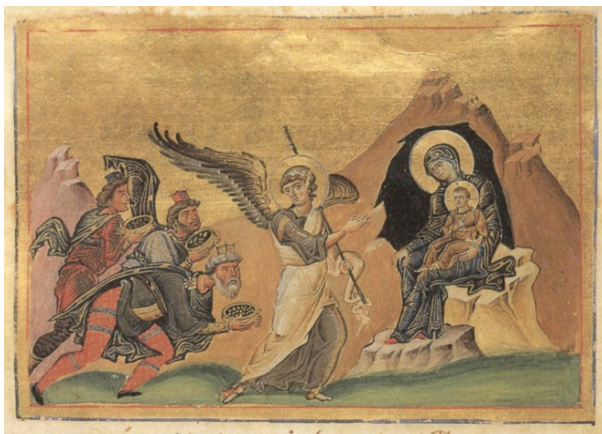
Adoration of the Magi , miniature, X-th century, The Menology of Vasile the Second, The Vatican Library, Rome.

There are also the Magi of San Vitale, they wear mantles, red fezzes and they have gifts in hands. The procession is moving to the Virgin sitting on the throne, holding Jesus, together with Archangels.