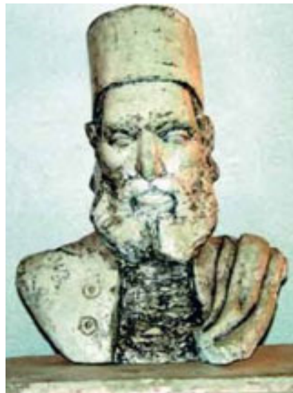
Bust, deacon Coresi in the Museum