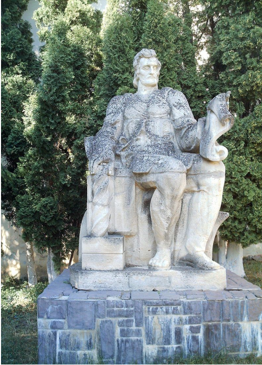
Deacon Coresi, statue in Saint Nicholas "The Church Yard, The First Romanian School of Braşov", Piaţa Unirii, Braşov