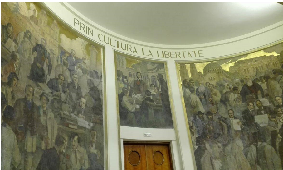
Detail – upper parts of the monumental painting by Costin Petrescu, Great Hall, Universitarilor Palace, Cluj-Napoca

The records of those times and also the restoration results reveal that one year later, in 1940, the entire painting was covered with a layer of paint so as to conceal the role of the Transylvanian scholars; over the years, other layers were added until in 1999, after restoration, they were scraped off the painting and the work of art was given back to the public in its original form. Thus, the painting in the Great Hall of the Universitarilor Palace was severely degraded by this covering method and we now consider that it would have been more proper to choose the same approach used for the Romanian Athenaeum, where the fresco created by the same artist was covered with red velvet during communism (from 1948 to 1966) so as to hide the monarchy's role in Romania's history.