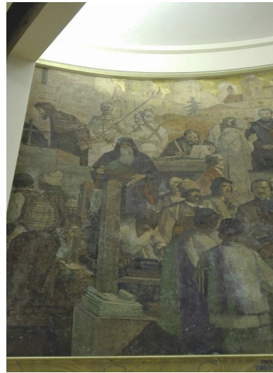
Details form the upper part of the composition "Cultural History of Transylvania", by Costin Petrescu, 1939, Great Hall, Universitarilor Palace, Cluj-Napoca.

The stylistic approach of the painting, with wide strokes and a sober colour palette in the upper part, is in contrast with the lower part where all the personalities' portraits are rendered by a schematic drawing with a cobalt blue simple line, on an ochre background with golden geometrical shapes and approximately in the same position as in the upper part. On this film of colour, under each portrait, the name of the depicted person appears and this enables the understanding of the upper composition, which comprises the portraits of the most representative scholars in Transylvania in the period 16 th century – 19 th century, as follows: Metropolitan Bishop Simion Ștefan, Archpriest Radu Tempea, Paul Iorgovici, Cantor Dimitrie Eustatievici, Bishop Ioan Inocențiu Micu, Gheorghe Șincai, Petru Maior, C. Diaconovici Loga, Ion Molnar Piuariu, I. Budai Deleanu, Priest Samuil Micu, Bishop Vasile Moga, Andrei Mureșanu, Ștefan Octavian Iosif, George Coșbuc, Metropolitan Bishop Andrei Șaguna, Octavian Goga, Gheorghe Barițiu, Gheorghe Pop de Băsești, Vasile Goldiș, Simion Bărnuțiu and Timotei Cipariu.