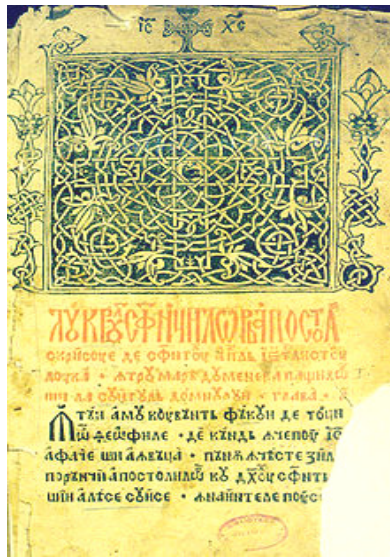
The Apostle, 1566, by Coresi

This remarkable and valuable person whose statute has been captured in written documents or fine arts portrayals, opened the way for writing in Romanian , and the Coresian image has been known and appreciated, especially starting from the 18 th century until now, due to researches in the field of history, theology and fine arts. 2016 has been declared by the Saint Synod of the Romanian Orthodox Church also the commemorative year of religious typographers, one of whom is Coresi, depicted in this article aiming to highlight the Coresian image.