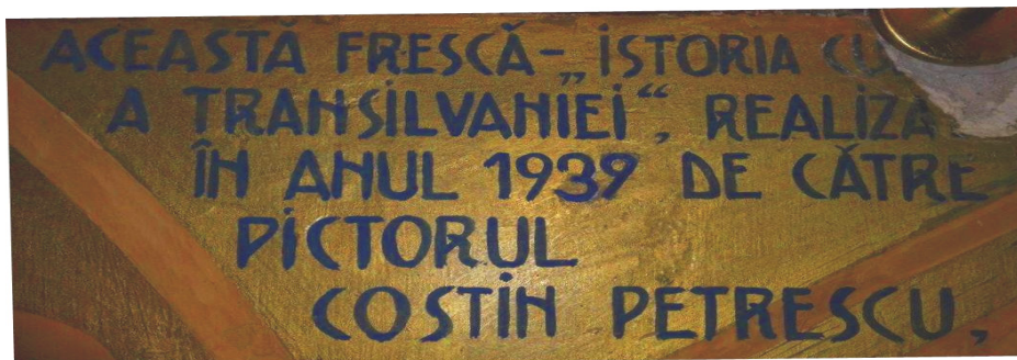
Detail from the monumental painting by Costin Petrescu, Great Hall, Universitarilor Palace, Cluj-Napoca

art, while for the lower part he used the technique of oil on plaster made of lime and gypsum 6 . This lower area, a narrow one, but covering the same length with the one made in the fresco technique, displays the legend of the composition situated on the upper part, where characters are placed in chronological sequence from left to right, starting from deacon Coresi, on the same vertical axis with Sava Brancovici, the Metropolitan Bishop of Ardeal.