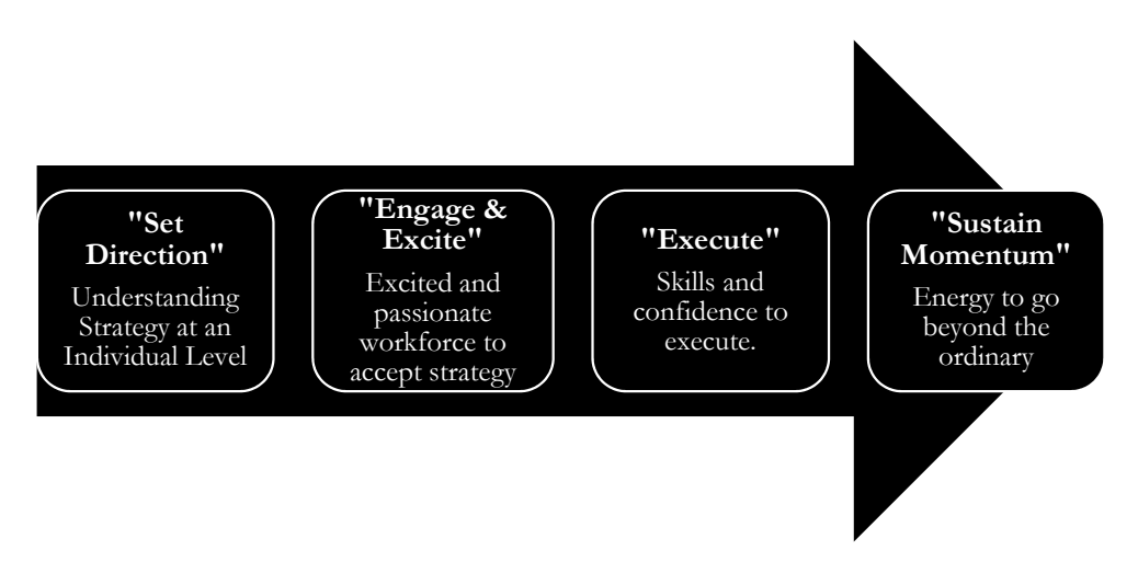
Figure 1. Critical Forces of Strategy Execution

Strategy execution is commonly defined as the practice of bringing a strategy to fruition. As defined by RogenSi's Strategic Leadership Execution Framework, four critical forces that drive strategy execution at an exceptional level are:- Set Direction, Engage & Excite, Execute and Sustain Momentum (RogenSi, 2012).