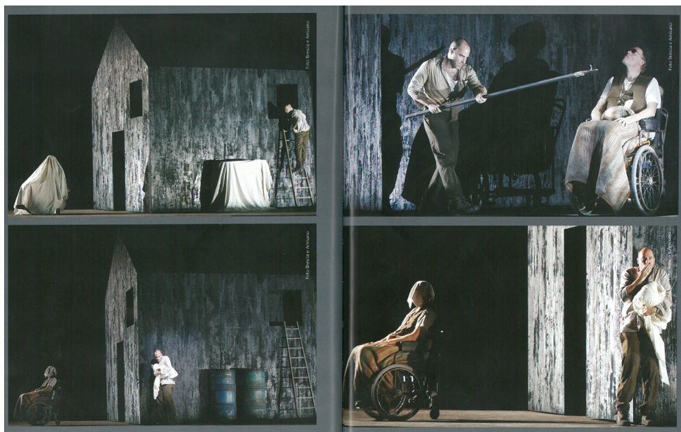
Gy. Kurtág's Fin de partie (Premiere at La Scala, Milan, November 2018)

With characteristic meticulousness, Kurtág composed the work over a period of about seven years (between 2010 and 2017), and the opera displays a panoply of emotions, ranging from the tragic and lyrical, to the grotesque and oneiric, but never abdicating the poetic. This is a hallmark of the composer, always resistant to belonging to anything that might be called a trend.