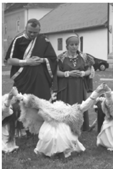
Fig. 3. The reenactment of an antique ritual to Mars during Alba Carolina Citadel Roman Festival (Alba Iulia).

Obviously, the audience manifests a positive attitude towards this manifestations, reenactment groups specialize themselves in narrow historical periods they reproduce, diversifying in interpretation, interactive activities, equipment and performances – representing factors of progress in this heritage interpretation form in Romania and proof of aspiration to the professionalism, the level and dedication of the reenactment association with a longer tradition mentioned before at the international level.