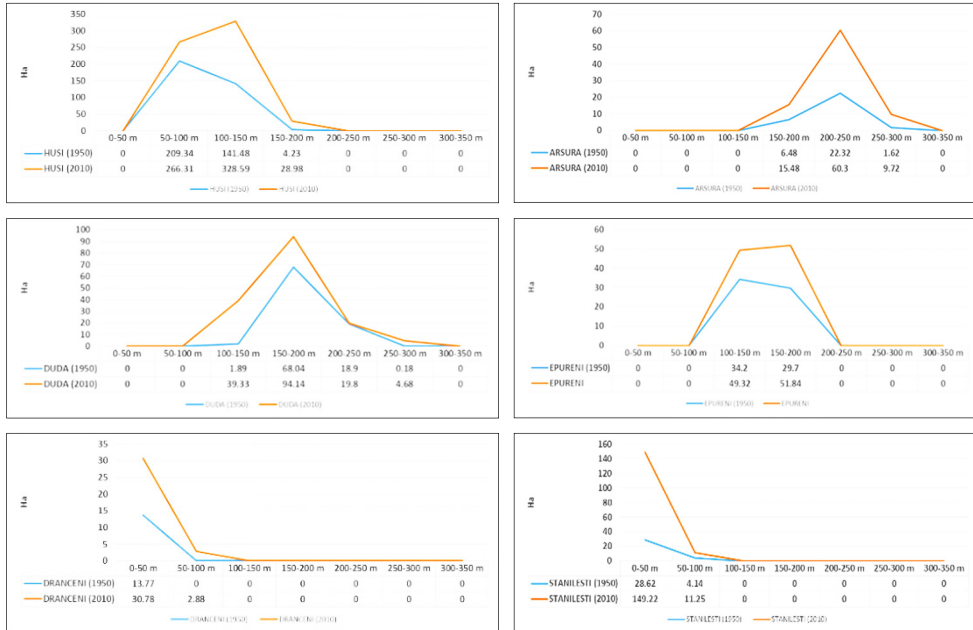
Fig. 3. The distribution of the built area (ha) on altitudinal classes (1950-2010).

slope of Prut valley and in a lesser extent in the upper third of it. Ghermănești village has expanded eastward at lower altitudes, on the interfluvial ridges bordering the valley of Luncani and descending slightly to the valley of Prut.