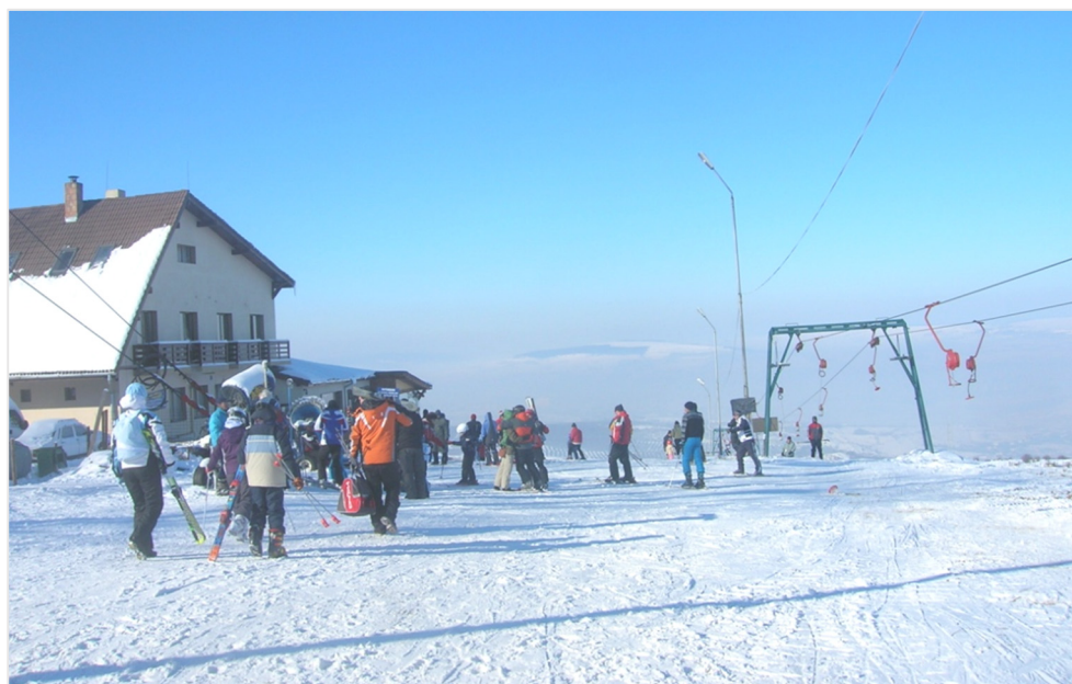
Fig. 2. Teleschi Guesthouse and the starting point of Feleacu ski slope

as well as a flat (for four people), which suggests an accommodation capacity of more than 50 beds. Imperial Guesthouse is probably the one which appears in the INS data with 16 accommodation beds, although its website states that there are 9 double rooms, so 18 beds. Gold Fayen House has, also according to its website, 21 beds in 8 rooms. “Lacul Micești” Guesthouse near Micești (in Tureni commune, too) provides 11 rooms to tourists, which accounts for about 22 beds, and a chalet for groups of 8 to 10 people. It comes out that the real accommodation capacity in Tureni commune is about 120 beds, compared to just 16 that are registered by the INS.