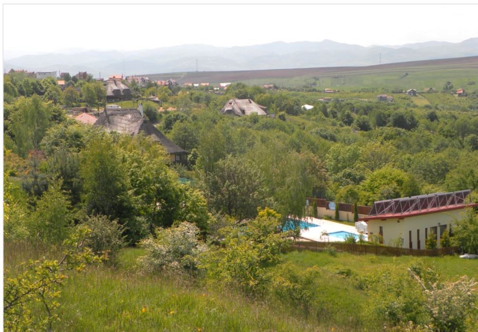
Fig. 3. “La Mesteceni” Guesthouse in the newly-built part of Sălicea village

After 2012, one noticed the same constant growth, based primarily on the ever higher number of overnights at the two guesthouses in Ciurila commune. In 2015, the values rise more than four times due to the overnights registered at Hotel Premier (Feleacu commune), more than 10000, representing almost 78% of all the overnights in the studied region.