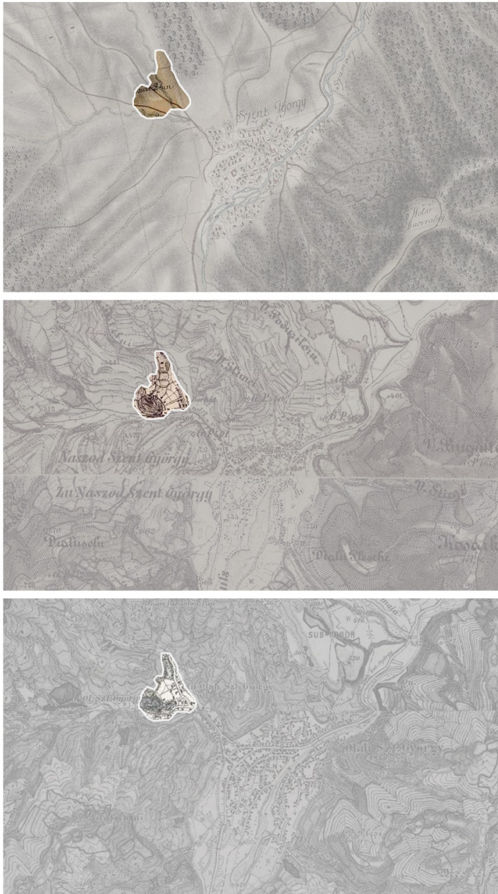
Fig. 2. - Maps depicting the clear evolution of the developments (in the north-western part of the town) under the influence of the Frontier Regiment; 1763-1787 (top), 1806-1869 (centre), 1869-1887 (bottom).