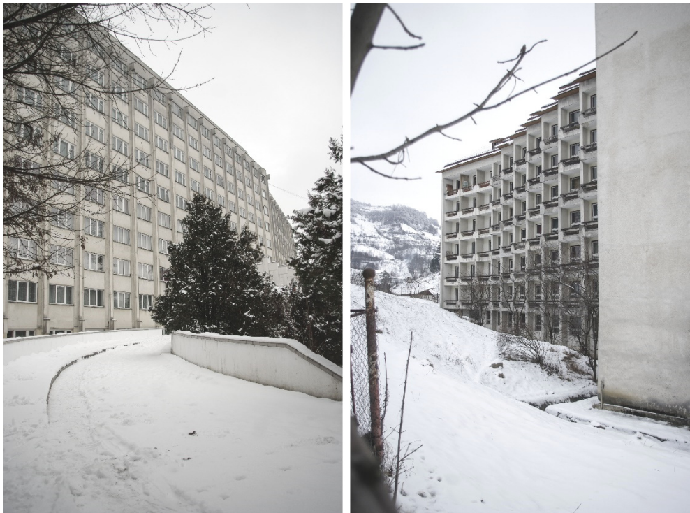
Fig. 9. – The current state of the hotels built during the socialist period. Even though they can be regarded an architectural counterpoint to the Belle-Époque spa-town's built repertoire, these buildings should imperatively be a part of any strategy concerning the spa-towns revival, being an important part of its heritage.

trait for these individuals or groups being a desire to do better. This should either refer to the improvement of a way in which things are developing currently or to a responsible approach towards mending the realizations of the preceding incentives (Fig. 9). The nod to John Ruskin's works at the beginning of the article has not been unintentional, his works being advocates of how practical action and understanding – that it is the duty of the privileged, or in this case those in a position where they have the possibility to act, to make their world a more beautiful and self-aware place – an attitude that in the case of Sângeorz-Băi is somewhat present, but in a form that is polluted by an unclear strategy and a fascination for immediate financial gain.