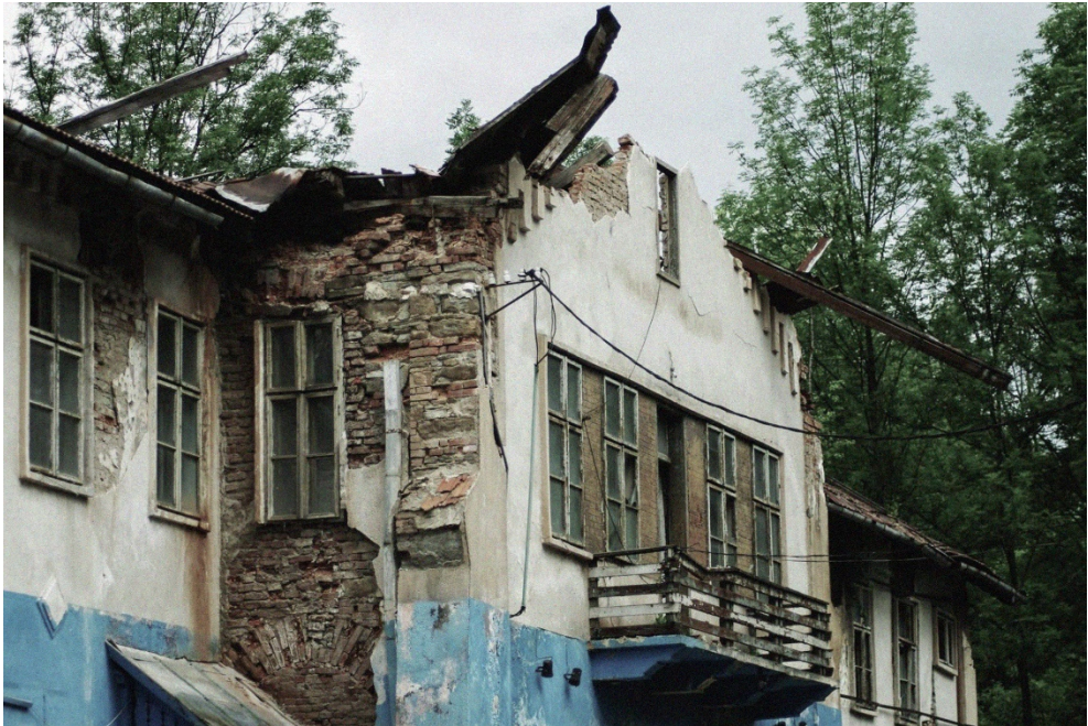
Fig. 1. – Vila 13, or The Old Hebe Hotel , prior to its demolition in 2018.

“The person to be named mayor of a spa town will be needed to possess an academic title.” 3