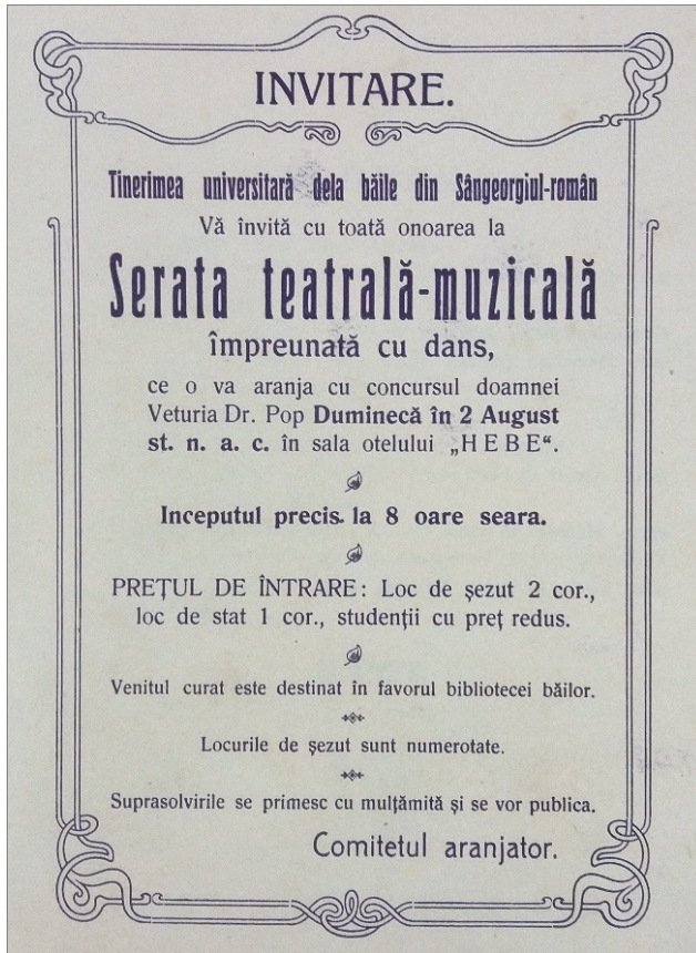
Fig. 4. - Cultural event invitation from the year of 1914, depicting the cultural activities that the Spa-Town visitors and locals could attend to.

particular spa-town, it appears that the relation between the two entities was one of relative success, the pair augmenting each other in the common search for emergence. However, not all other Romanian establishments had the same fate.