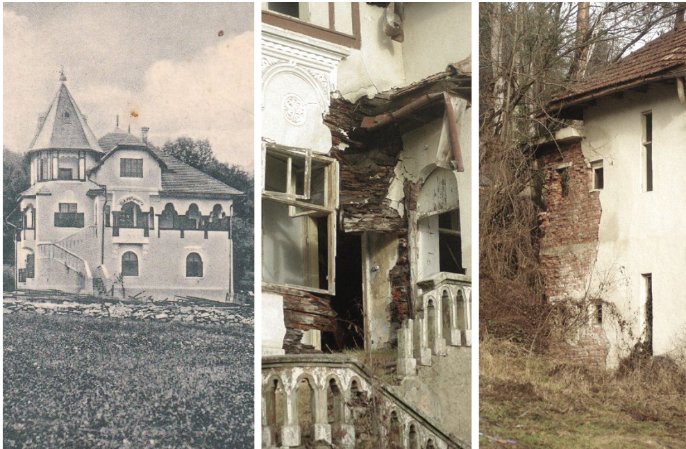
Fig. 6. – The past and present of Vila 1 (or Vila Porumbița), a historical monument plagued by neglect. On the left, the building upon its inauguration, on the right and centre, its state in the summer of 2018.

Villa 13, for example, with its ownership permanently disputed between local authorities and other different entities found itself becoming a restaurant, and later a night club, with its once fully booked sleeping rooms being used for different types of offices and business venues. Vila 1, the only historical monument presents in Sângeorz-Băi (Fig. 6), saw itself exchange ownership between several state institutions, such as the Romanian Intelligence Service or the County Council of Bistrița-Năsăud (Gheorghe, 2016), the constant property swaps participating directly in its present day decadence, with the building finding itself on the brink of destruction.