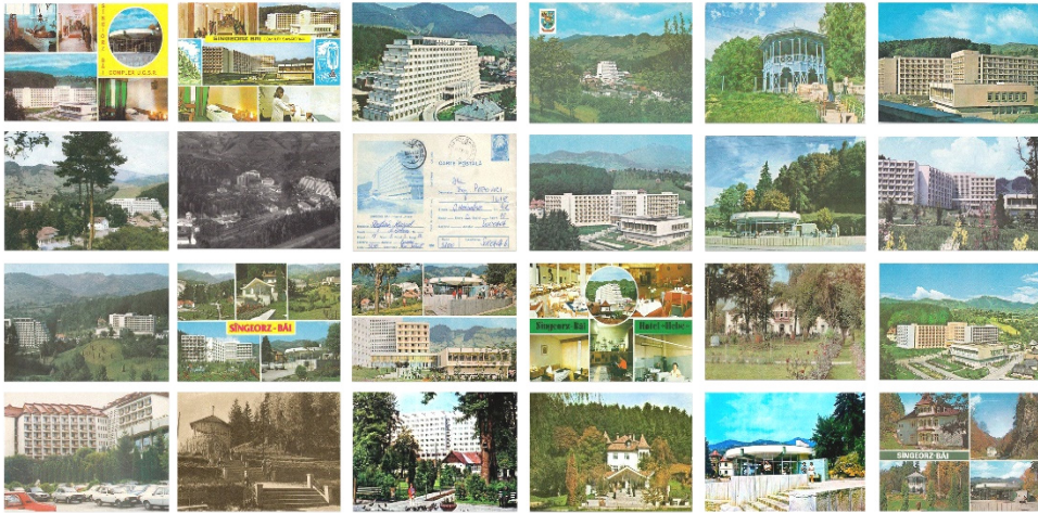
Fig. 5. – Selection of postcards from Sângeorz-Băi, from its socialist embodiment.