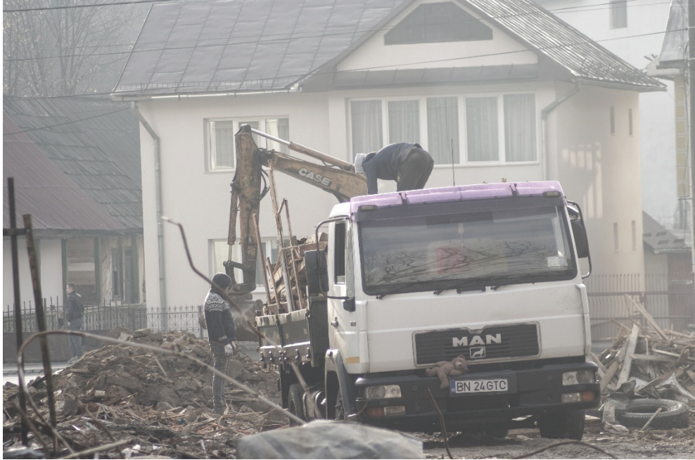
Fig. 8. – The demolition of the Dr. Ciuta Sanatorium in the summer of 2018, after years of disputes regarding its ownership.

These are the years defined by the spa-town's search for belonging, which find it in a most awkward and difficult position, on the brink of losing its already shattered identity.