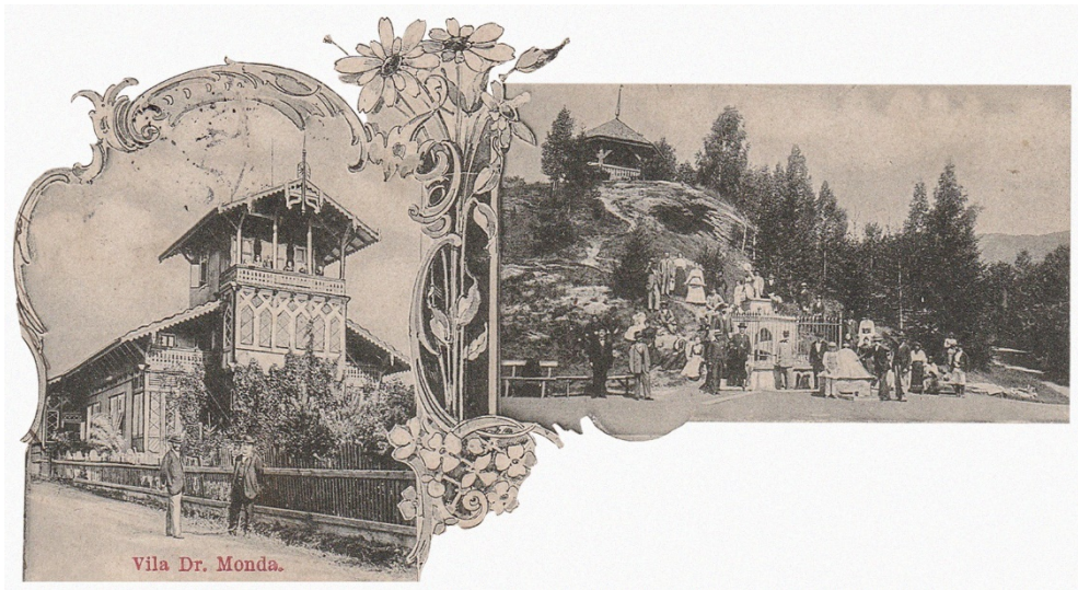
Fig. 3. - Images representing some of the first dwellings constructed in Sângeorz-Băi’s territory, offering insight into the atmosphere present at those times.

of the old village and its mineral springs (“Prospect of the ‘Hebe’ Alkaline Baths from Sângeorgiul-Român”, 1904, p.8). The public’s interest towards music, fine dining and organized trips throughout the neighbouring surroundings that the brochure exposes, along with the medical facilities that it presents, confirm the impact that the Hebe Society had on the village. Although not a political group itself, the society worked with the local authorities for the benefit of the village. The contract signed between the two parts feature agreements such as: the right of demanding plots that the society may use for constructing leisure facilities, the obligation for the Hebe group to invest in buildings and the park, and the obligation to keep a constant medical presence in the spa-town. The contract also states that the building materials and work force that will be needed will be provided by the town officials (“Lease Contract between the Society and the Town”, 1922). These fragments of insight regarding medical organization-local administration relationships exemplify the manner in which political representatives of the establishments entrusted in the aforementioned societies, underlining the role of the administrative units as a supervising one.