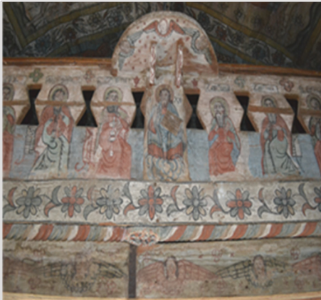
Fig. 3. Painting fragment