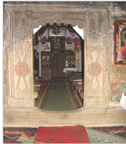
Fig. 6. The gate entrance to the nave

Arrived in front of this church, one does not know what to admire first: the spirit of meticulousness and patience of the rural craftsmen, the brilliant manner in which they blended certain architectural laws, “the artistic beauty of the entire sanctuary and the lonely parties, clarity of lines, the solid building, groomed design, light changes and shadow, harmony with surrounding fusion power and grace of the entire” (Steinbrucker, 1932).