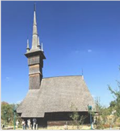
Fig. 1. The church in Rogoz

On the UNESCO World Heritage List, there are eight wooden churches in Maramureș, including “Sfinții Arhangheli Mihail și Gavril” Church in Rogoz village, Lăpuș Land. This church was constructed in 1663, as stated by the inscription at the entrance, after the Tartar invasion from 1661.