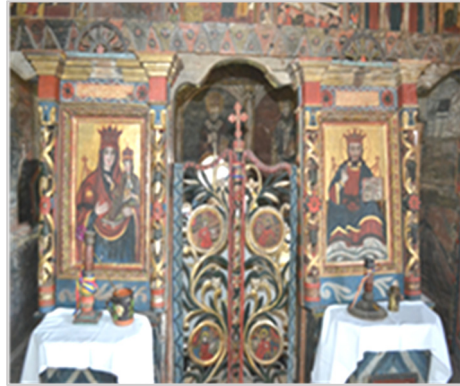
Fig. 2. Church rood screen