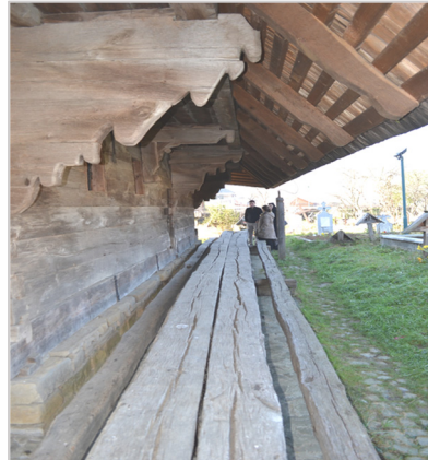
Fig. 4. “Horse heads” and “the old men table”