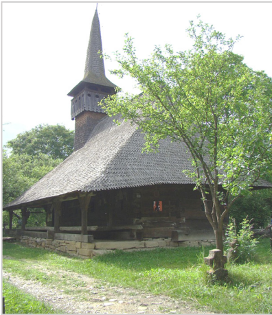
Fig. 5. The church in Lăpuș