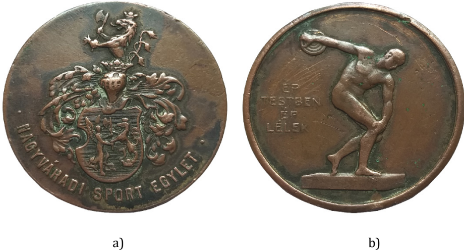
Illustration 1. a-b The Nagyvárad Sport Egylet Medal (from the collection of the National Museum of Banat)

Round shaped medal, made out of metal: bronze, undated, diameter 30x30 mm, weight 10.40 grams (Illustration 1). The front side (Illustration 1a) presents the coat of arms of Nagyvárad city, with an inscription in capital letters under the heraldic composition saying “NAGYVÁRADI SPORT EGYLET”, delimited by a dot on each of its sides. The back side (Illustration 1b) presents a thick edge, inside of which there is a discus thrower (a work which resembles the Discobolus of Myron), and a four-line inscription saying “ÉP TESTBEN ÉP LÉLEK”.