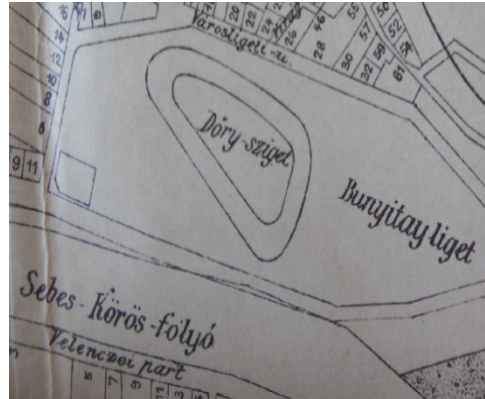
Picture 7. Insula Dóry (Dóry Island) and Bunyitay liget (Kemény, 1912)

Because the lease agreement for Grădina Rhédey concluded between the Polgári Lövészegylet association and the City Hall of Nagyvárad expired on January the 1 st , 1910, Nagyvárad Atlétikai Club requested from the City Hall the right to use Sporttér and the Dóri lake and island from Városliget (Bunyitay Liget), for sports related purposes (Sas, 1910) (Picture 6 & 7).