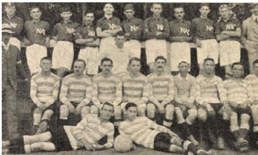
Picture 8. Nagyváradi Atlétikai Club – Miskolci Atlétikai Club (Katz, 1911)