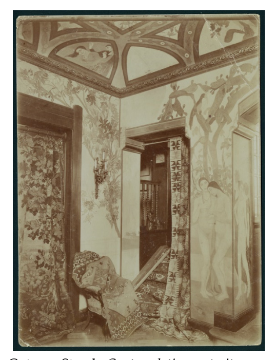
Figure 5. Cecilia Cutescu-Storck, Contemplative portraits, mural painting.

The painter Nicolae Tonitza (1886-1940), also gifted with various skills from religious frescos to satirical illustration in newspapers, strongly reacted against the mimetic and idyllic style, largely cultivated in the field of mural painting, starting with the middle of 19th century. At the beginning of his career, Tonitza was involved in the re-painting some old monuments before The Great War (in 1904 the church of Grozești, Bacău, in 1911 the church of Poeni, Vaslui, 1912, Scorțeni, Bacău, 1914, Netezești, Ilfov)<sup>11</sup>, activity unfortunately less studied by art historians. Tonitza – labelled by his circle of artists-friends as "The Byzantinist" of the group - wrote articles that put into question various sides of the concept of "national style". Some of his theoretical conclusions derived from the artistic practice. As a mural painter, Tonitza imposed to himself to avoid that he used to consider to be the "trivial mixture between Byzantine and Renaissance features" <sup>12</sup>.