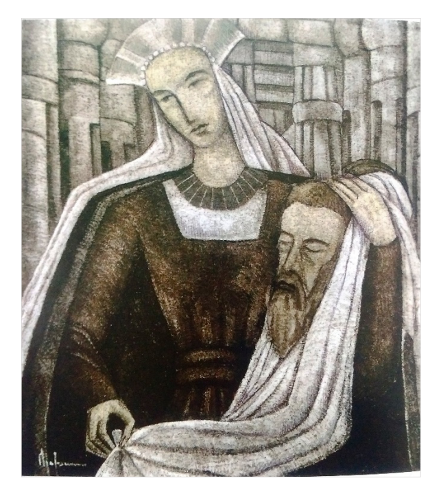
Figure 6. Olga Greceanu, Salomée, oil on cardboard, 1927.

Nowadays the interest for the interwar painting animates largely the Romanian public, mainly from nationalistic and religious viewpoints. The study of the beginning of the organized artistic education in the field of decorative art was came in the forefront for the art historians in the last ten years, while modern religious mural painting remains an unexplored field of research. The relationship between art the tradition had a fluctuant evolution. Frequently quoted in the painting of 1920s, the interest in it slowed down in the 1940s when the coryphées of national style Francisc Şirato şi Ion Theodorescu-Sion, changed their discourse.