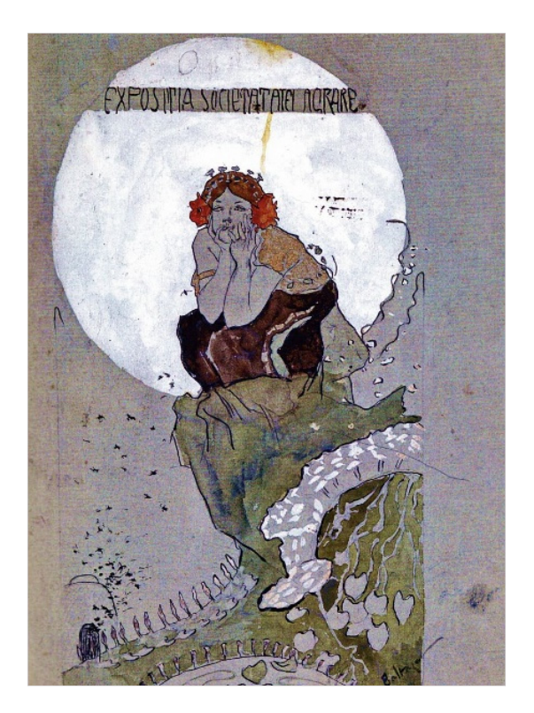
Figure 3. Apcar Baltazar, Project for the poster for the Exhibition of the Agrarian Society, 1906.

In the Romanian artistic milieu, the byzantine revival and its practice of symbolic and literary quotations, was mirroring the confluence between historicism and Art Nouveau, direction which reached its highs at the beginning of the 20th century and goes off with the outbreak of the First World War.