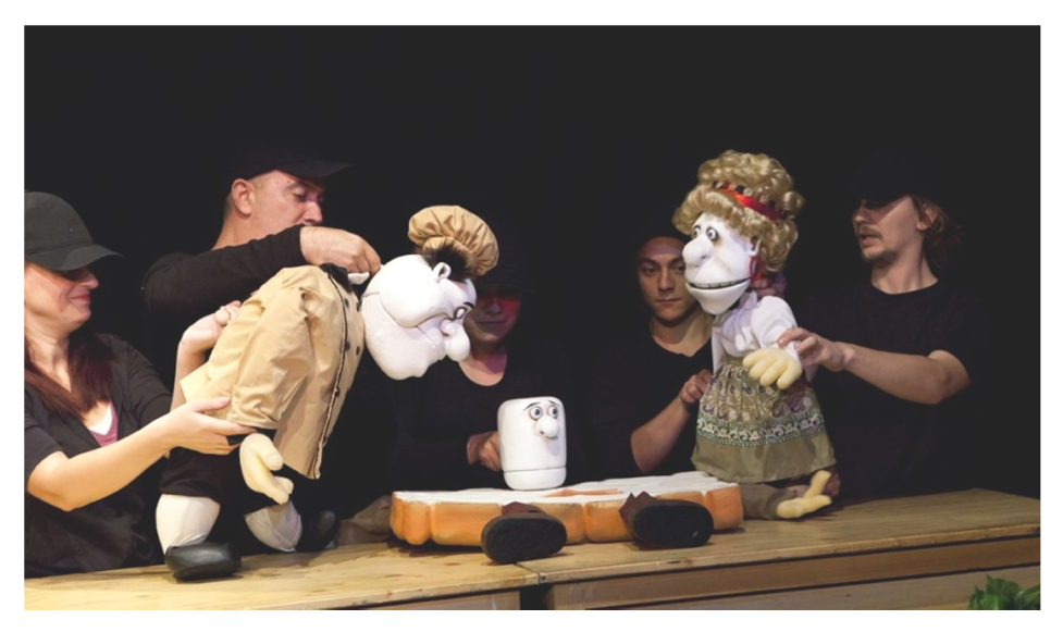
Fig. 2 : Scene from A Midsummer Night Dream , performance 16+, created by Cristian Pepino, Țăndărică Theatre in Bucharest, 2017

When it comes to the tickets price, the fact that all these companies are financed by the state is of a great importance. Theatre tickets are very affordable related to the average income and cost of life. All tickets are subsidized so anyone can come to watch a show.