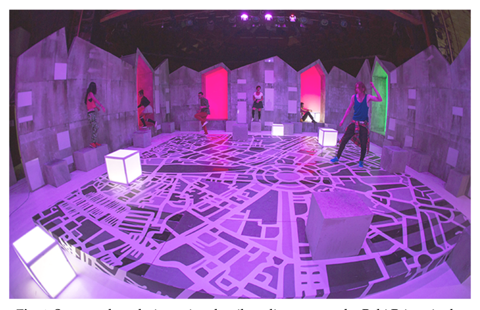
Fig. 1 : Space and set design using the silent disco system, by Bobi Pricop in the performance The Green Cat , Luceafărul Theater in Iași

shows focusing on directly engaging children and teenagers, as a form of discovery and collective action, in order to transform communities and reform the social classes".