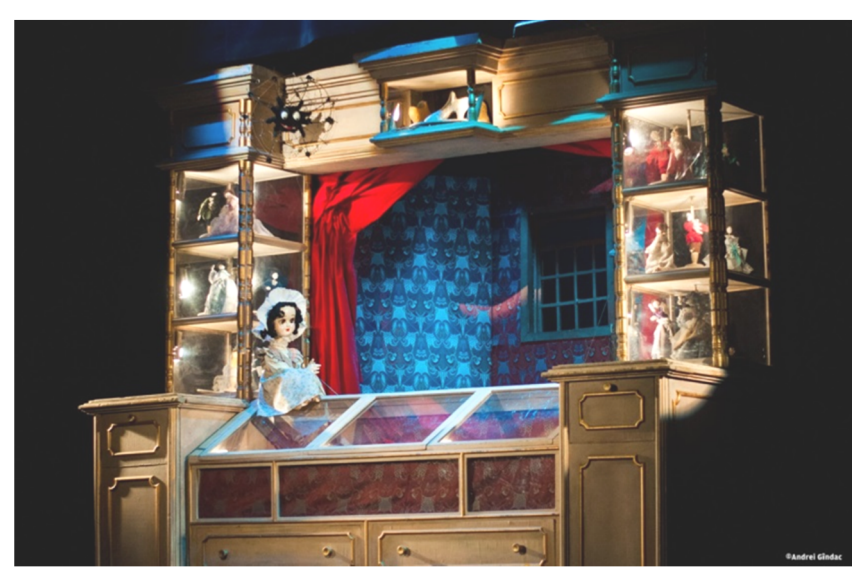
Fig. 1: Set design created by Carmen and Gheorghe Rasovszky, for the performance Cinderella , stage direction Silviu Purcărete, Teatrul Țăndarică Bucharest, 1990.

contests (Bucharest Ion Creangă Theatre), workshops and guidance during the composition of a new dramatic text (Bucharest ImPuls Festival) or assuming this aesthetic mission and staging mostly contemporary drama (Sibiu Gong Theatre).