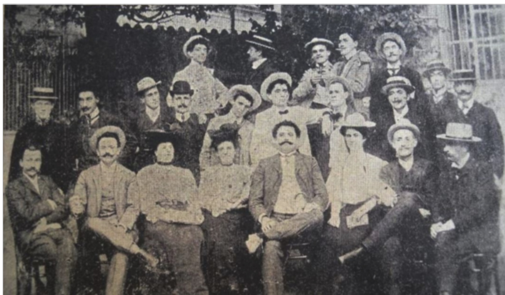
Fig. 1: The Grigoriu Company, first decade of the XXth century