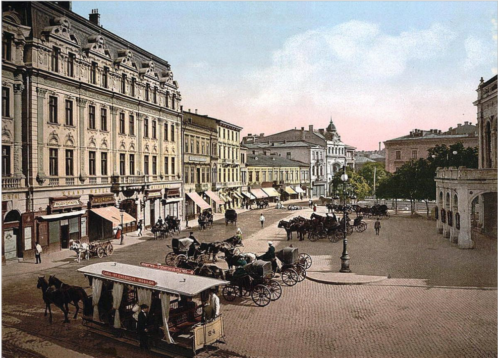
Fig. 7: The Square in front of the National Theatre with the Oteteleşanu Terrace in the background, on the right, 1915.