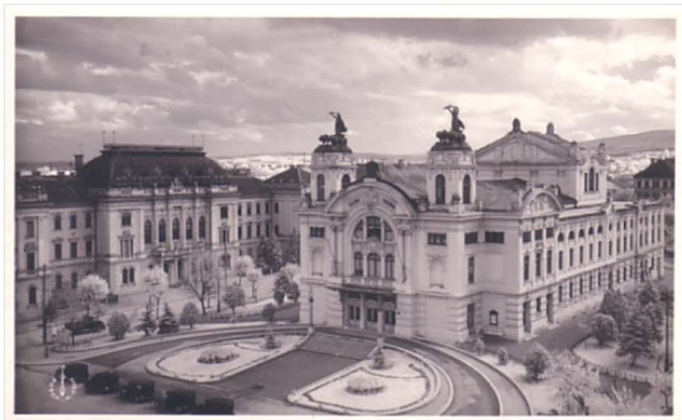
Fig. 9: The National Theatre in Cluj-Napoca after World War I and the Great Union

Similar to his master C. I. Nottara, his acting style belongs to Romanticism, emphasizing feelings, and fostering the musical values of words. Zaharia Bârsan adds a classicist, more restrained dimension, assumed from the theatre of Vienna, where he studied, and a natural tendency, borrowed from Italian verismo . The first feature, enhanced by the Enlightenment, makes the actor seem to officiate with certain solemnity, like a lay priest that reveals existential truths, while the stage turns into a secular altar. This taxonomy will long persist in the tradition of the Cluj stage. He preferred the drama, the Shakespearean and the Romantic repertory. Among his great achievements, we mention the main parts from Hamlet , Macbeth , King Lear , all plays by W. Shakespeare, from Ruy Blas by Victor Hugo, Răzvan și Vidra by B. P. Hașdeu, Vlaicu Vodă by Al. Davila, other parts like Carl from Hoții (The Robbers) by Fr. Schiller, Luca Arbore from Viforul (The Blizzard) by B. P. Hașdeu.