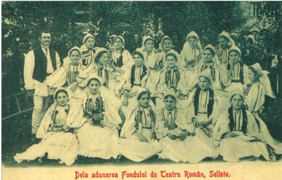
Fig. 3: Photograph of one of the encounters of The Society for Romanian Theatre Fund of Transylvania, in Săliște.

The first Romanian dramatic text was published in Transylvania as well, in 1780, under the title of Occisio Gregorii în Moldavia Vodae tragedice expressa ( The Killing of Gregory, the King of Moldavia, depicted in a tragic register ), by an anonymous author, a text that was apparently performed by the same students from Blaj. It depicts the fight of Romanian kingdoms for freedom and national independence. The play is structured as a modern tragicomedy, with aspects of parody, nonverbal parts of circus or pantomime, scenes inspired by the popular theatre from Romanian folklore. The interest and love for theatre nurtured by the Romanian people of Transylvania is also illustrated by the 1800 publication of the first translation of Hamlet , signed by Ion Barac, with the title Amlet, Prințul de Dania .