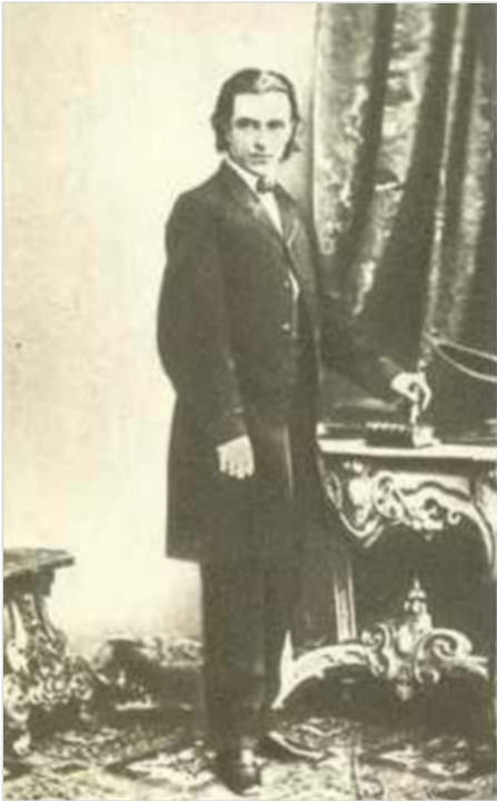
Fig. 4: Mihail Pascaly (1830-1882), famous actor, company director, pedagogue