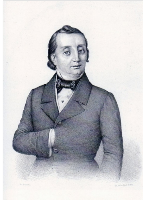
Fig. 5: Matei Millo (1814-1896), famous actor, stage director and playwright

Considering the requirements of the time and the public, the repertory was formed of historical plays and comedies written by great Romanian writers such as V. Alecsandri, B. P. Hașdeu, C. Negruzzi, but also by Al. Lapedatu ( Tribunul ( The Tribune ), about Avram Iancu).