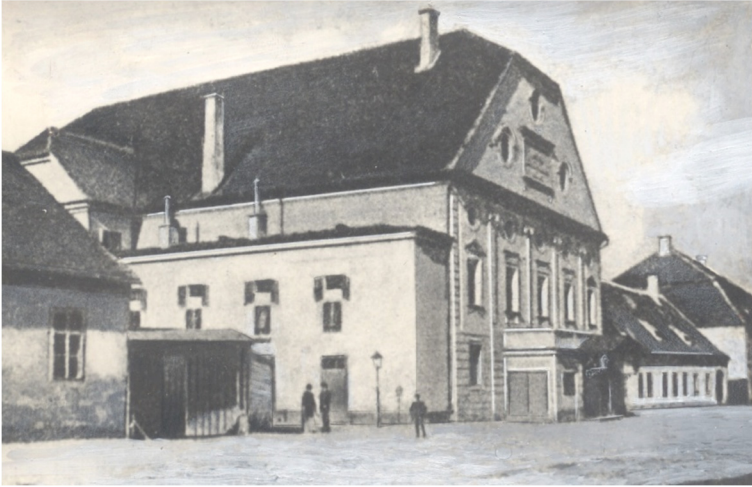
Fig. 1: The Hungarian National Theatre in Cluj (1821-1906)