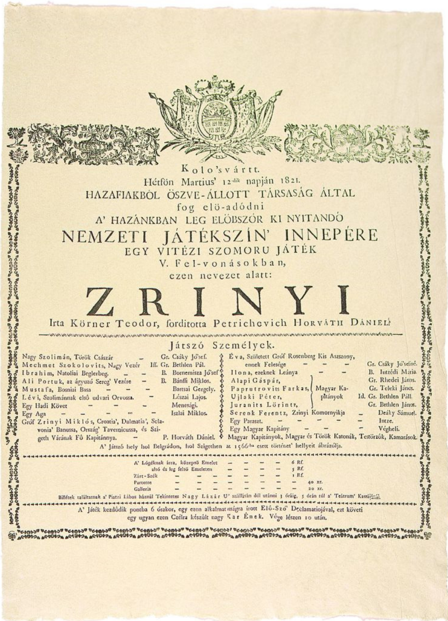
Fig. 3: The playbill of the Zrínyi tragedy, 11 March 1821