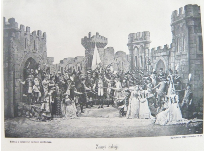
Fig. 8: The tableau vivant of Zrínyi's Oath after the photo taken by Dunky fivérek [Dunky brothers] (11 November 1892). On the center baron Béla Szentkereszthy as Zrínyi