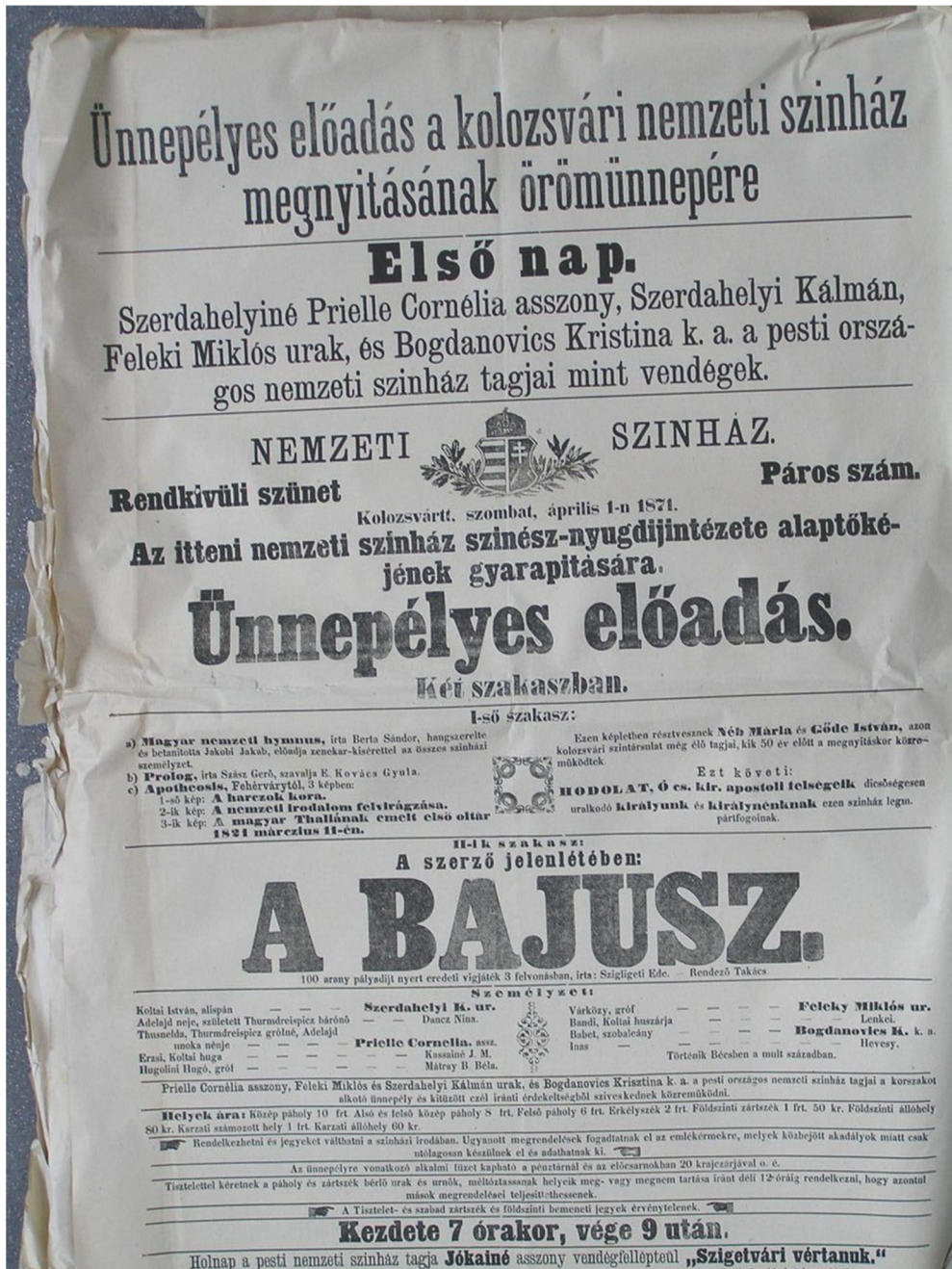
Fig. 5: The playbill of the festive program on 1 April 1871