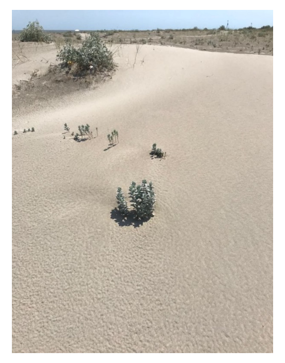
Figure 2. Habitat 2110 – Sfântu Gheorghe beach

Other important species: Centaurea arenaria subsp. borysthenica, Gypsophila perfoliata, Eryngium maritimum, Cakile maritima subsp. euxina, Secale sylvestre, Astrodaucus littoralis, Euphorbia seguieriana, Bromus tectorum, Salsola soda, Crambe maritima (Doniță et al., 2005).