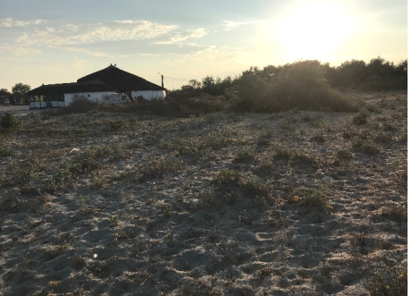
Figure 5. Sulina Beach - Eryngium maritimum indicates the presence of habitat 2110, which is in a state of degradation, due to the grazing of horses and cows (left) and the presence of commercial areas (right).