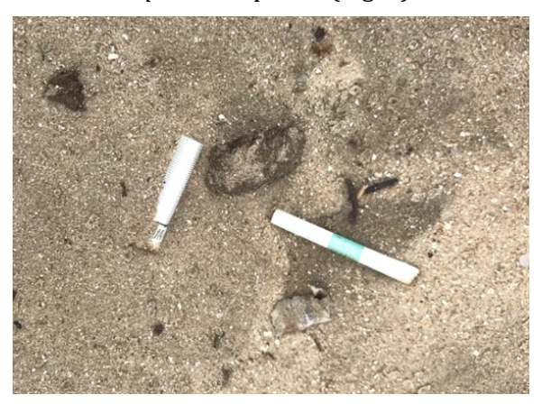
Figure 4. Sulina beach - Terrestrial macro-pollution with plastic and micro plastic represented by cigarette butts.

The habitat is also in a semi-natural state, but the current anthropogenic impact on it is of medium intensity. Sulina beach is much more populated than Sfântu Gheorghe beach, and with the increased number of tourists, the number of risk factors on the habitat increases. Three risk factors not encountered on Sfântu Gheorghe beach were identified: beach cleaning, improving access in the area and extinction of C. persicus species (Fig. 5).