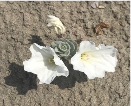
Figure 1. Convolvulus persicus L

It is a psammophile, xeromezophile plant that prefers dry, neutral and poor sands in nitrogen (Dihoru and Negrean, 2009). It forms populations that develop in the form of large colonies, the accompanying species being mainly confined to the periphery of the association. C. persicus forms the association Convolvuletum persici Borza, 1931 (Făgăraș and Jianu, 2015). The floristic composition of the association is poor in species (37 taxa). The following species from the orders Festucetea vaginatae and Festuco-Brometea were mostly present: Alyssum borzaeanum, Alyssum hirsutum, Bromus tectorum, Secale sylvestre, Medicago falcata, Silene conica, Astragalus varius, Euphorbia seguieriana, Centaurea arenaria subsp. borysthenica, Stachys atherocalyx, Scabiosa argentea, Ephedra distachya, Linaria genistifolia, Silene borysthenica, Sideritis montana, Marrubium peregrinum, Senecio vernalis, Cynanchum acutum, Papaver rhoeas, Cerastium pumilum, Polytrichum piliferum, etc. (Management plan ROSCI0073, 2011).