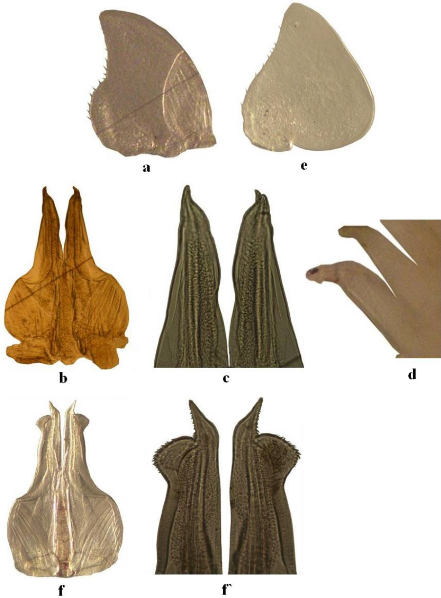
Figure 3. Protracheoniscus vasileradui nov. spec. Holotyp, ♂ 5 x 2 mm, a. exopod pleopods 1, b. endopod pleopods 1, c. apex of the endopod pleopods 1 – ventral view, d. apex of the endopod pleopods 1 – profile view. Protracheoniscus politus , ♂ 6.5 x 2.8, e. exopod of pleopods 1, f. endopod of pleopods 1, f'. apex of the endopod pleopods 1.