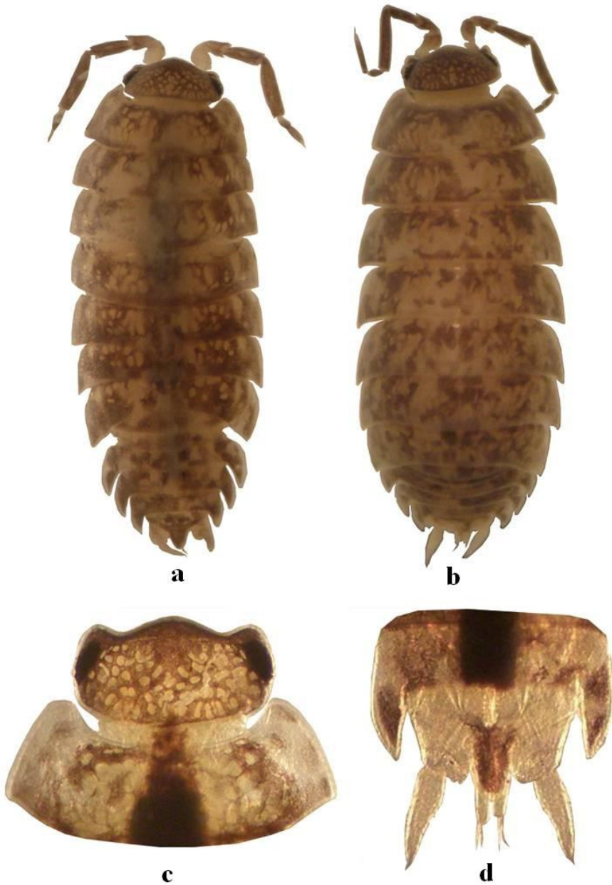
Figure 1. Protracheoniscus vasileradui nov. spec. Holotyp, male and female dorsal view: a. ♂ 5 x 2 mm, b. ♀ 5.5 x 2.2 mm, c. cephalic lobes, d. pleotelson.