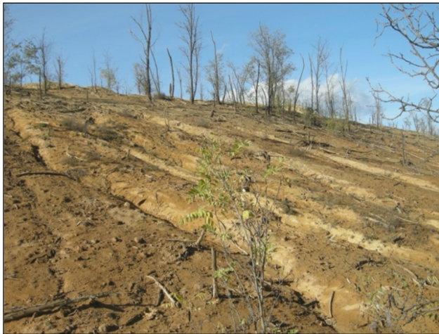
Fig. 6. The ornamental acacia in T_2 terrace.

On the terrace T_2 in the ornamental acacia trees area, the majority of the shrubs disappeared, resisting only a few specimens (figure 6). Also, the trees of acacia are almost dried totally. The drying of the green vegetation and of the trees on the upper terrace surfaces T_2 is the result of massive mobilization of tailings from the upper terraces T_3 and T_4 caused by wind and rain in the spring and fall.