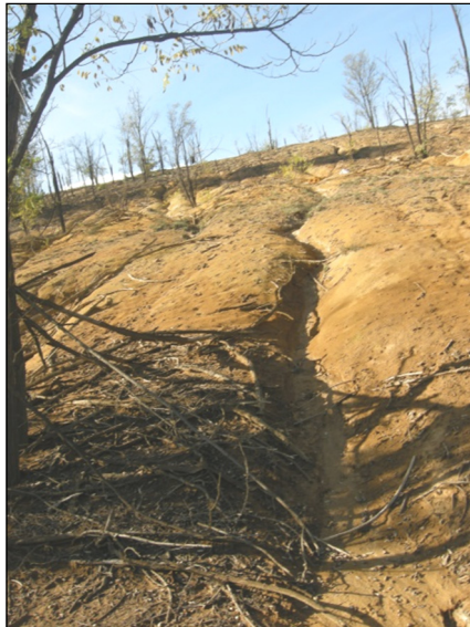
Fig. 4. Ravines on T 1 terrace.

The grassy vegetation grows in spring from seeds spread by wind, but quickly disappears as a result of chemical conditions, of tailings slides under the influence of rainwater and because of the wind or of the lack of moisture. The tailings layer, with a sandy texture, cannot hold water. Strong insolation and rising temperatures lead to rapid elimination of the humidity in the superficial layer.