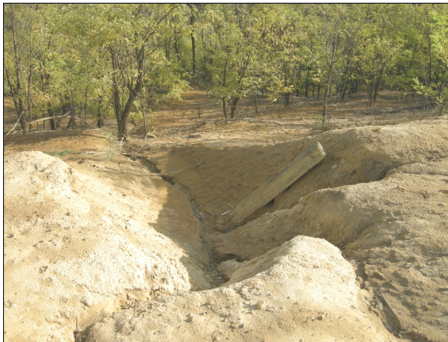
Fig. 3. Ravines on terraces T_3 .

The phenomenon is a reason of concern because the exfiltration solutions in the lake start and maintain the processes of acid mine drainage in the terraces of the pond, causing damage in their stability, which can cause landslides of surfaces or dam breaking, unless appropriate measures are taken to fix the problem by draining the solutions in the pond.