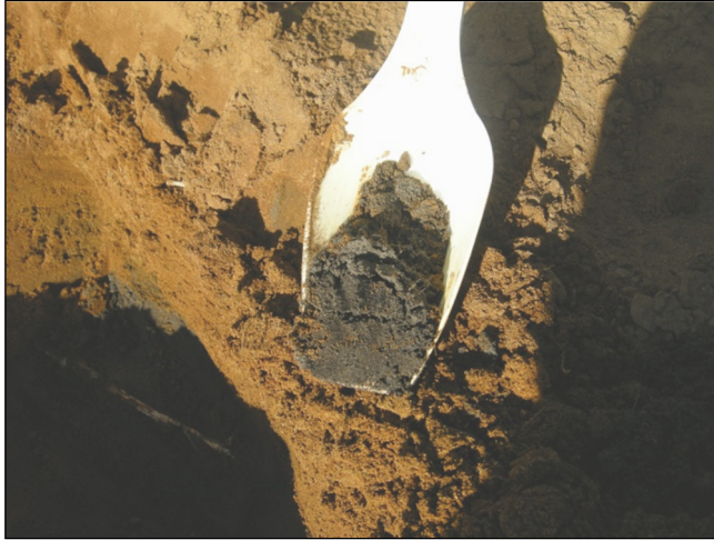
Fig. 5. The layer of embankment dam of the belt (starter dike).

On the terrace T_2 in the ornamental acacia trees area, the majority of the shrubs disappeared, resisting only a few specimens (figure 6). Also, the trees of acacia are almost dried totally. The drying of the green vegetation and of the trees on the upper terrace surfaces T_2 is the result of massive mobilization of tailings from the upper terraces T_3 and T_4 caused by wind and rain in the spring and fall.