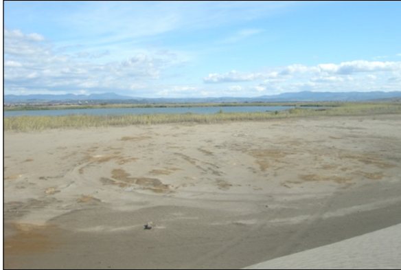
Fig. 2. Tailings beach.

The winds have blown the tailings that formed the top of the lake scattered in on the lower terraces.