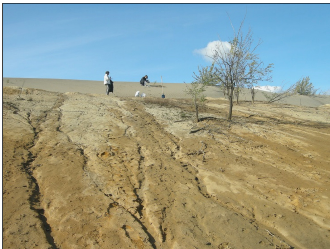
Fig. 7. T 3 terrace.

On the terrace T 3 where acacia trees were planted directly into the tailings dumps without the application of topsoil on the surface, the green vegetation is missing and the trees are mostly dry; the plants still living show obvious signs of drying branches and shoots (figure 7).