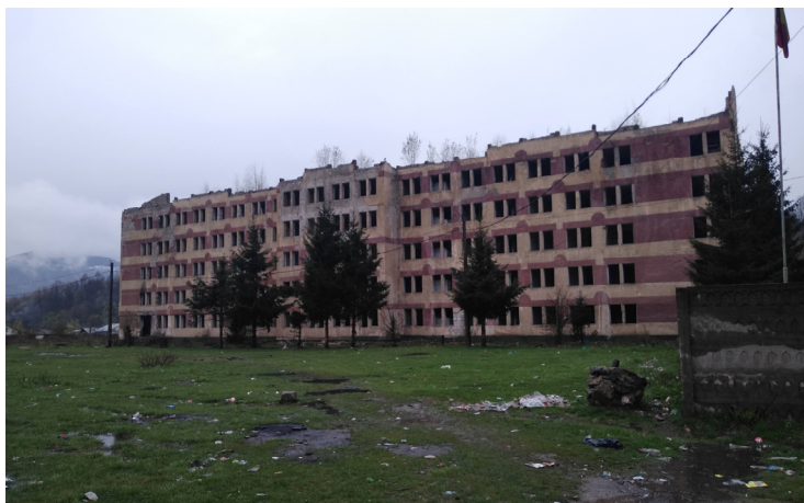
Fig. 7. Former Gendarmerie

In reality, in Petroșani city, there are a multitude of abandoned buildings (housing buildings especially in Airport neighborhood, residential houses, industrial buildings and structure, former thermal distribution points, etc.), which are in different stages of degradation and can be considered as factors of impact and risk on the urban environment.