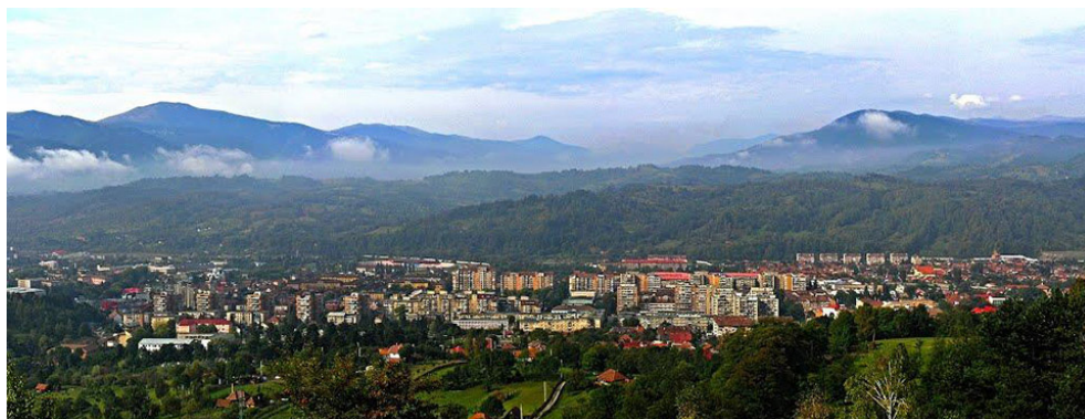
Fig. 2. Panoramic view of Petroșani city

Petroșani city is located on two important communication routes: DN 66 (E 79) Târgu Jiu - Simeria at the intersection with DN 66A Petroșani - Uricani - Câmpu lui Neag, with extension to Herculane and DN 7A connecting the city to Valea Oltului, Petroșani - Voineasa - Brezoi) (Negoe, 2019).