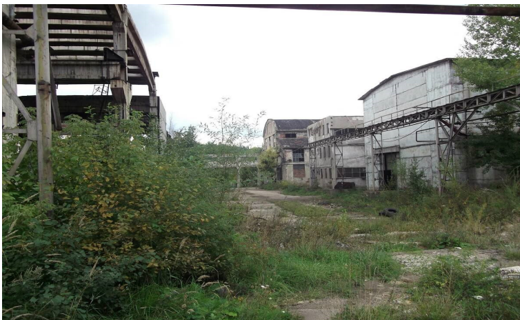
Fig. 4. Petroșani Central Workshops

Today, with the exception of the building located at gate 1, which functions as an event hall, from the former company a few workshops still operate (whose days are counted), the rest being practically abandoned (figure 4). And in this case we are also talking about a private property about which we weren't able to obtain much information.