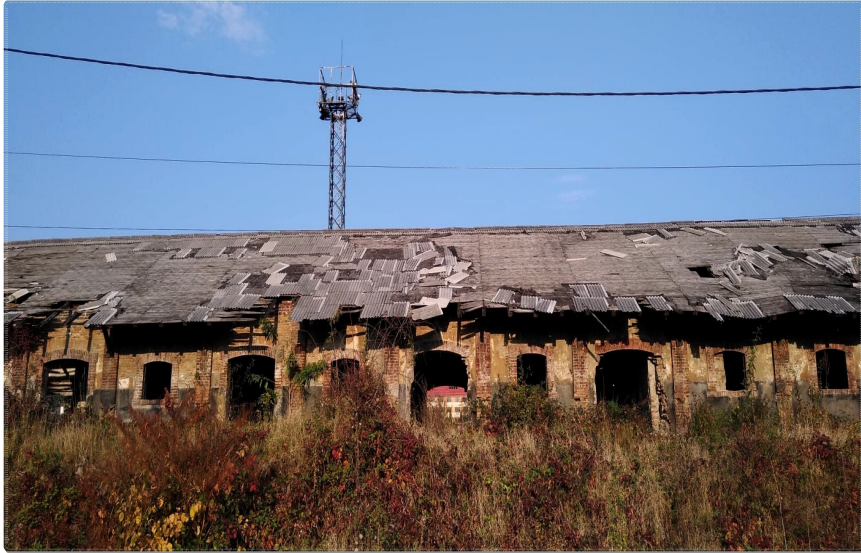
Fig. 6. CFR deposits

For a long time in these buildings, the needy people in the Colony District found their shelter turning them into real outbreaks of infection and causing some small fires.