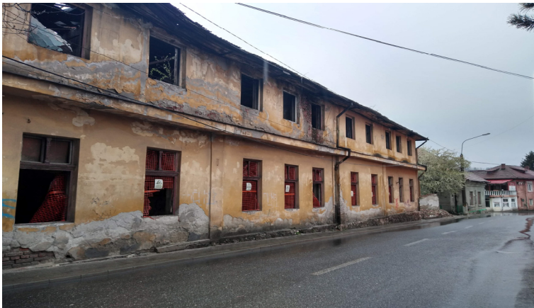
Fig. 3. Former Military Unit 01032

B1. Former Military Unit 01032 (private property, area 1) - constructed in the central area, is ruined on the day that passes, without the authorities being able to intervene (figure 3).