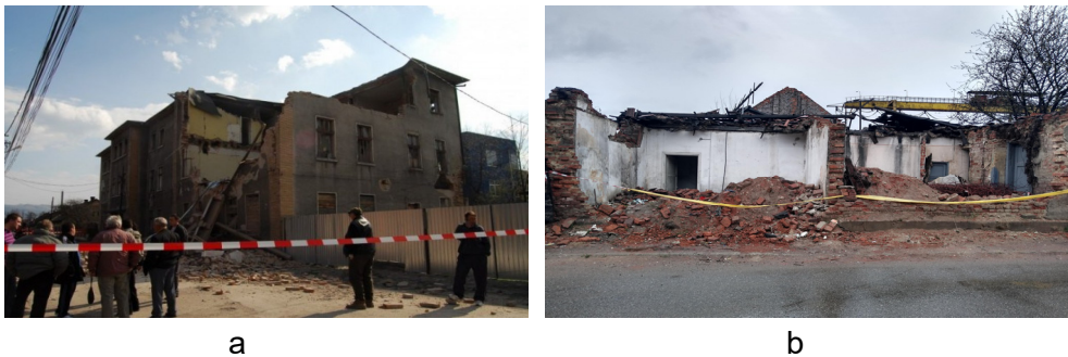
Fig. 5. CONSMIN buildings on Mihai Eminescu street (a) and Cărbunelui street (b)

B3, B4. CONSMIN buildings (private property, area 3) - as the company name suggests, it had as object of activity mining constructions and, as expected with the restructuring of the activities in this sector, the company went bankrupt.