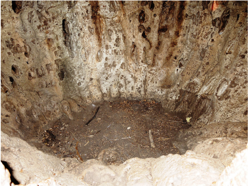
Figure 4. The image shows the base of the false cavity of Derby Boab Tree.

The canopy has several large branches, and its horizontal dimensions are 14.4 (NS) x 14.8 (WE) m. The overall volume of the tree is 60 m 3 (trunk and branches, including the false cavity).