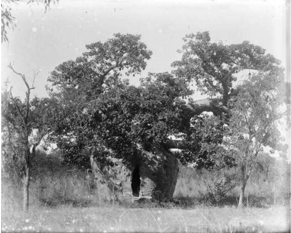
Figure 2. The first photograph of the Derby Boab Tree taken by Basedow in 1916.

The first photograph of the Derby Boab Tree dates back to 1916 and was captioned on glass plate by Herbert Basedow ( Figure 2 ).