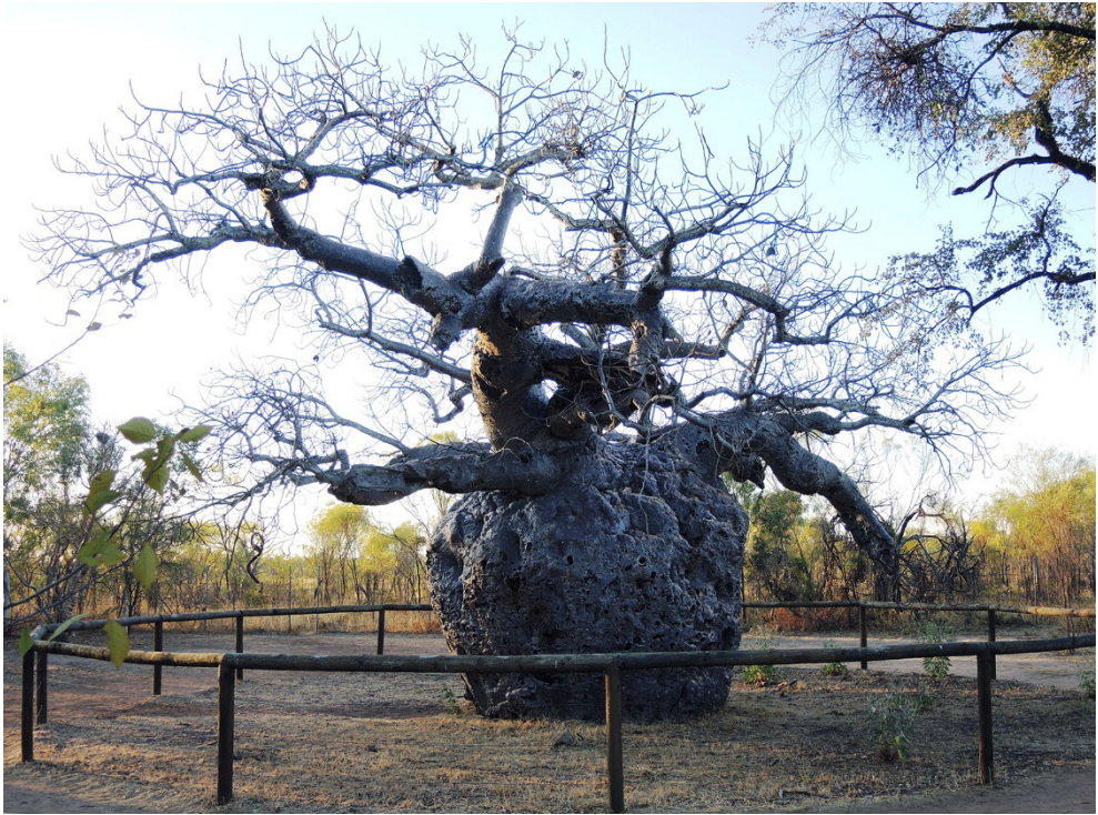
Figure 3. General view of the Derby Boab Tree as taken from the east.

The boab has a closed ring-shaped structure, with a ring of 3 perfectly fused stems around a false cavity which was never filled with wood.