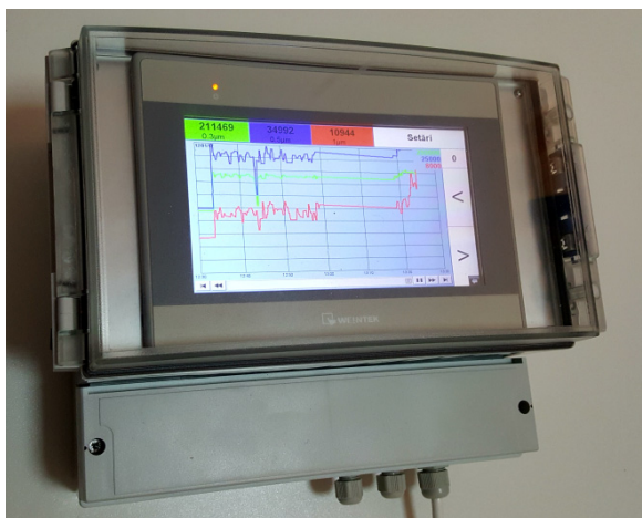
Figure 1. DUMO System for monitoring submicron airborne dust particles (Manufacturer SC ELECTRONIC APRIL, Aparatura Electronica Speciala SRL, Cluj-Napoca, Romania)