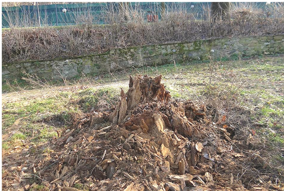
Figure 3. Image of the mutilated stump of the elm of Calafat

The wych elm of Sadova and its area. The multi-centennial wych elm ( Ulmus glabra ) is located in the Sadova village, a suburb of Campulung Moldovenesc city, Suceava county, Romania [17]. It can be found in a private garden, on a slope with south-eastern exposure, at a distance of around 50 m from a stream called Pârâul Morii, very close to its confluence with the Sadova stream. The GPS coordinates are 47°32.619' N, 025°31.573' E and the altitude is 659 m. The mean annual rainfall is 626 mm (Suceava station).