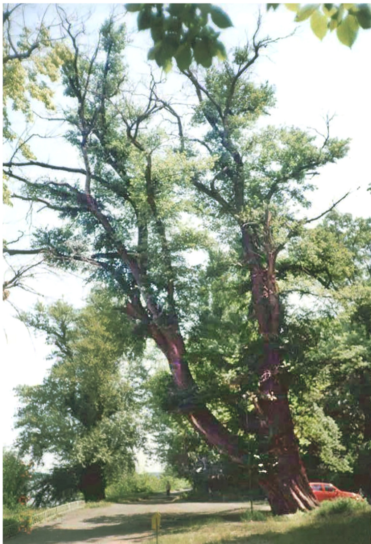
Figure 1. General view of the very large field elm of Calafat

The elm was already a very large tree in the 19th century, during the Independence War (1877–1878). Standing right next to the elm, on May 8, 1877, when a Turkish shell exploded at his feet, the future King Carol I of Romania uttered the memorable words: "This is the music I like!" [16].