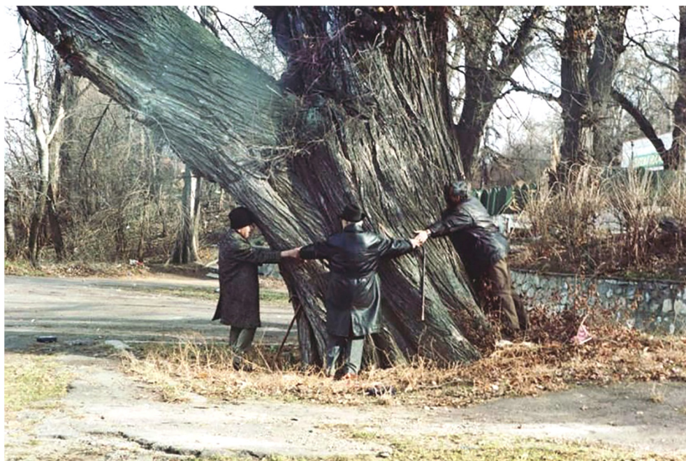
Figure 2. The photograph shows the twisted trunk of the elm of Calafat

In 2011, the circumference of the big elm was measured again and had a value cbh = 6.70 m.