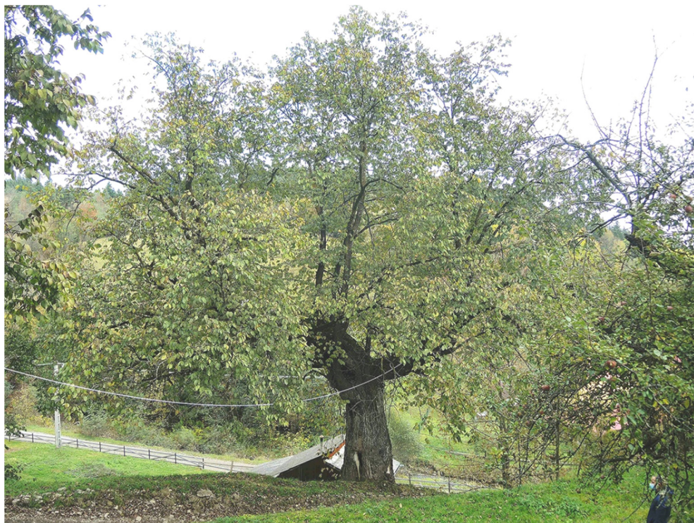
Figure 4. General view of the wych elm of Sadova

Another large hollow elm with a circumference cbh = 5.03 can be found at only 24 m toward the north. During the Second World War, in the hollows of the two elms, archival documents of the Câmpulung Moldovenesc Military Circle, a number of 25 weapons, carpets and other valuables were stored. Both elms are protected and have been declared Natural Monuments in 1934.